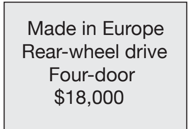
Exhibit 4.1. Conjoint card for automobiles

certainty when facing important decisions. Conjoint analysis is not perfect, but we do not need it to be. With all its assumptions and imperfections, it still trumps other methods.